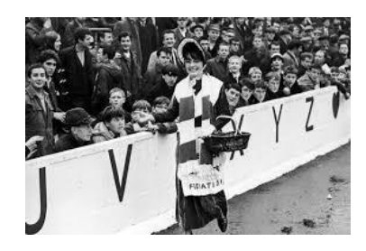
Toffee Lady Search is on Page3