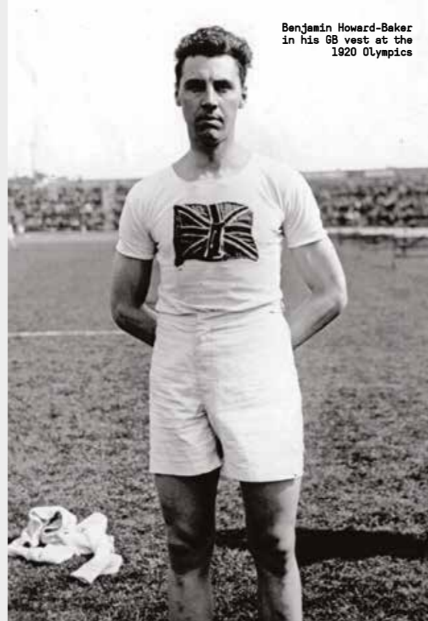
Benjamin Howard-Baker in his GB vest at the 1920 Olympics

The Daily Telegraph lauded him as 'The Liverpool jumper with the figure of Apollo'. He was selected to compete for his country at the 1912 and 1920 Olympic Games in Stockholm and Antwerp respectively. He came 11th in the high jump in 1912; eight years later, he finished sixth in the high jump and eighth in the triple jump.