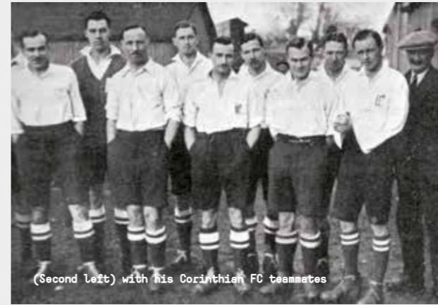
(Second left) with his Corinthian FC teammates

He made his first-team debut the following February in a 1-0 win against Chelsea at Stamford Bridge. The Liverpool Daily Post & Mercury reported of the debutant: 'Let it at once be said that the well-known amateur made a highly successful first appearance.' In his second game, a 2-0 defeat to Tottenham, it was noted that: '...he was heartily cheered for several brilliant saves.'