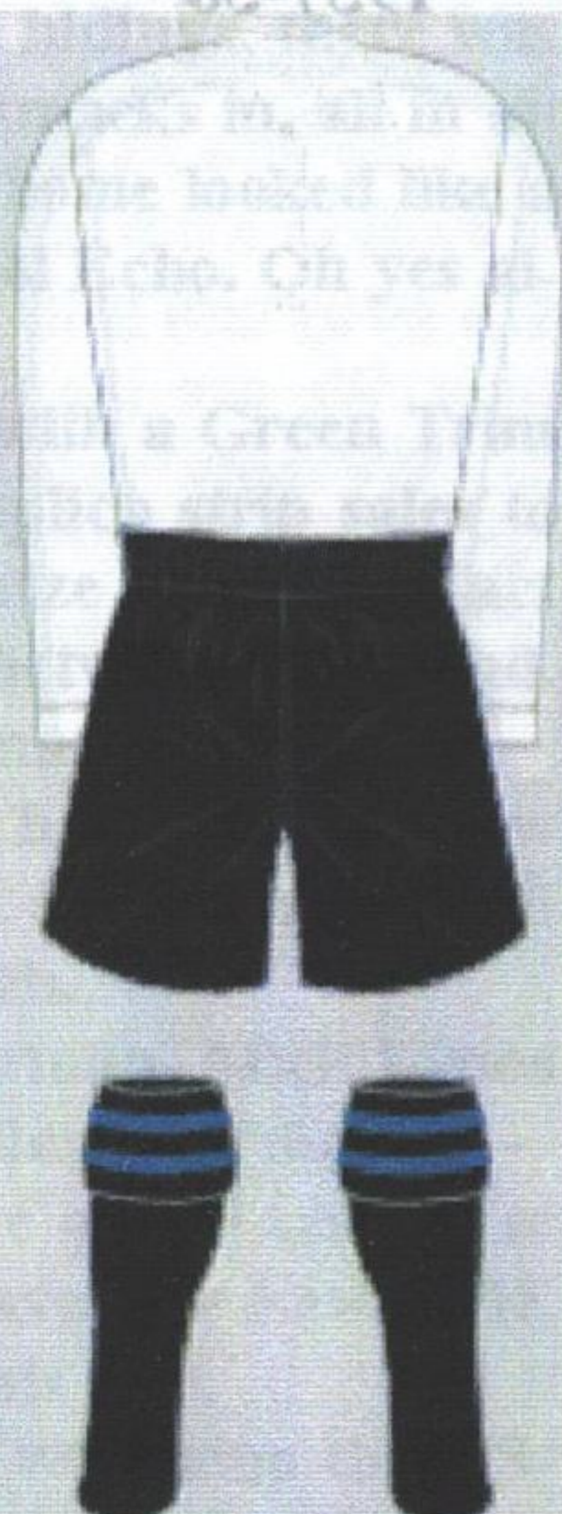
1933 Cup Final